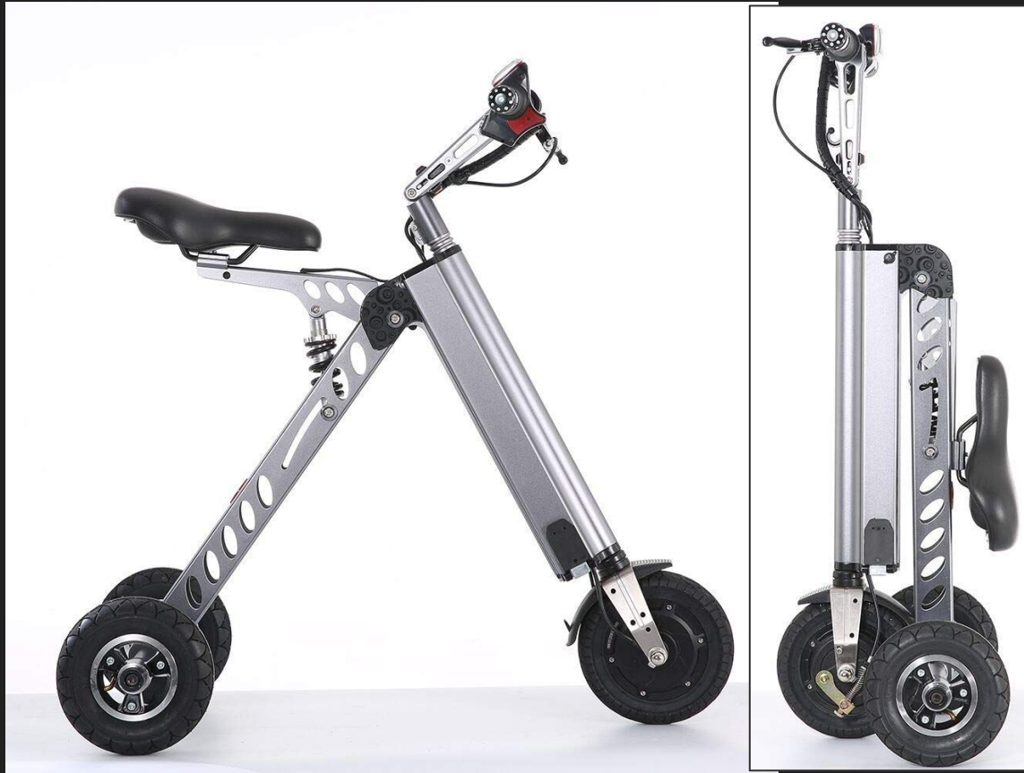
TopMate ES30 Electric Scooter