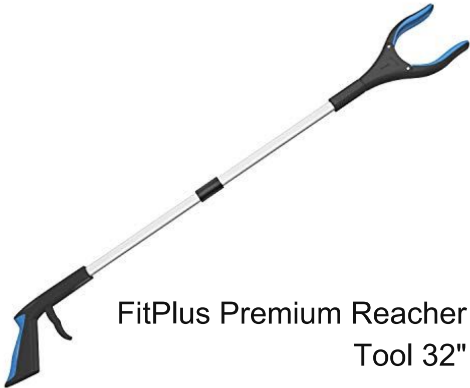
FitPlus Premium Reacher Tool 32"